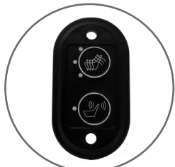
HEAT & MASSAGE (H/M)